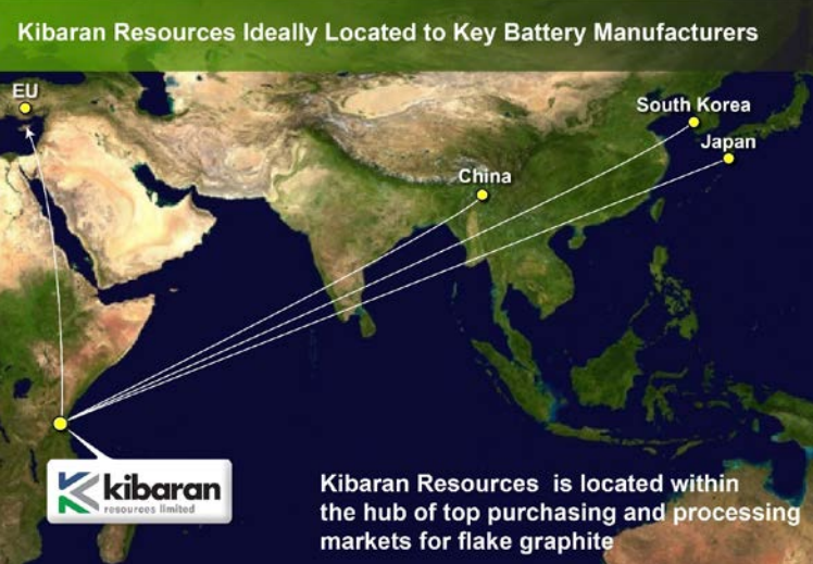
Figure 2 and 3 Location of graphite projects, proposed facility in Tanzania and access to battery manufacturers HIGH ENERGY DENSITY GRAPHITE

The development of a better battery product with higher energy efficiency, longer charge life or shorter recharge times has enormous commercial implications. Based on confidential market research, Kibaran believes its graphite from its unique occurrences with its ultra-high purity can play a major role in this very exciting new market.